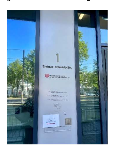
Entrance door 2nd floor