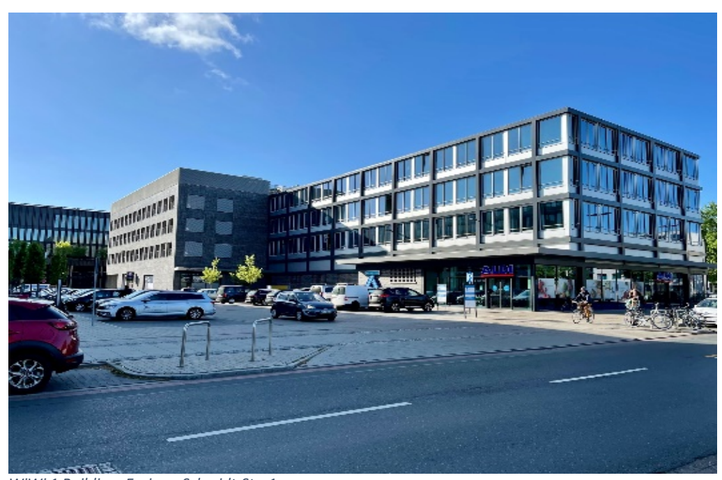
WiWi 1 Building, Enrique-Schmidt-Str. 1

Phone: +49 421 218-66871 E-Mail: lemex@uni-bremen.de