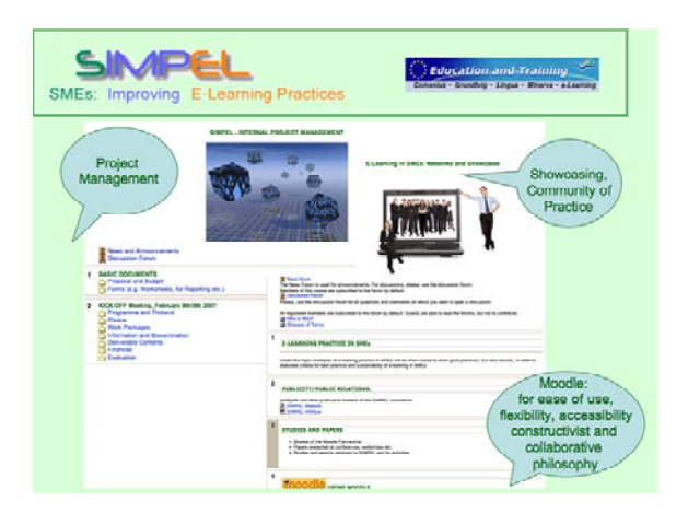
Fig. 3. The Use of Moodle in the Project SIMPEL

http://learningenvironment.alteredperceptions.org.uk; Moodle courses for the cleaning business: http://www.hma-university.com/; Moodle in the training hotel owners/managers: http://pce-savignac.com/moodle/index.php; IT and marketing courses: http://formazione.netcomsrl.com/moodle/